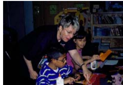
An Arkansas artist instructs a student as part of the Arts in Education program.