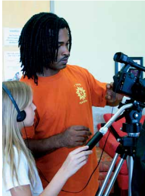
The T Tauri Program of the Ozark Film Fest

Each area of the state has impressive and sometimes distinctive creative assets to draw upon. The Northwest and Central Regions draw upon the centers of innovation located in the state's largest metropolitan areas, but the rural areas of the