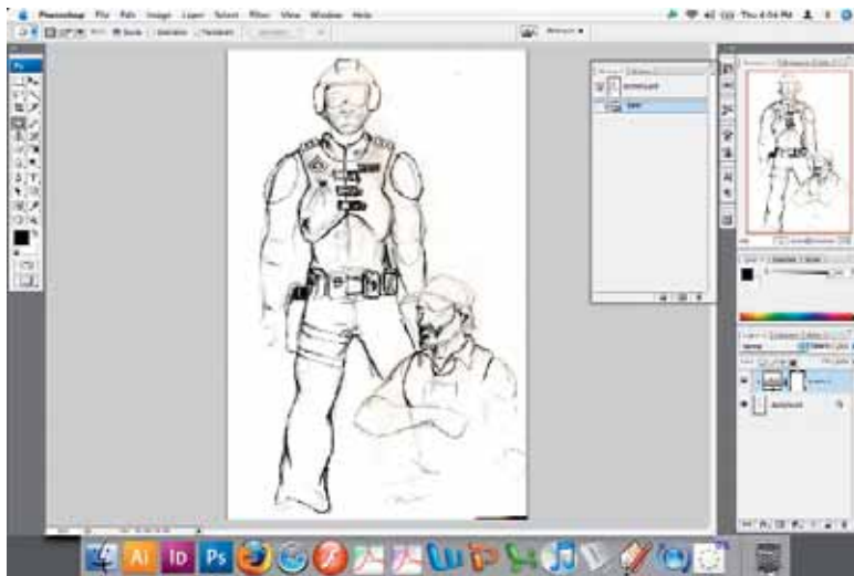
Students at the New Design School in Fayetteville provided digital design for a new video game.

OVER THE COURSE OF THE PROJECT, a number of people and places have stepped forward to champion or lead innovative efforts to build on the creative economy of Arkansas. Some were the result of small grants awarded to communities through this project, but others were purely local initiatives that recognized the economic potential of the arts and creativity.