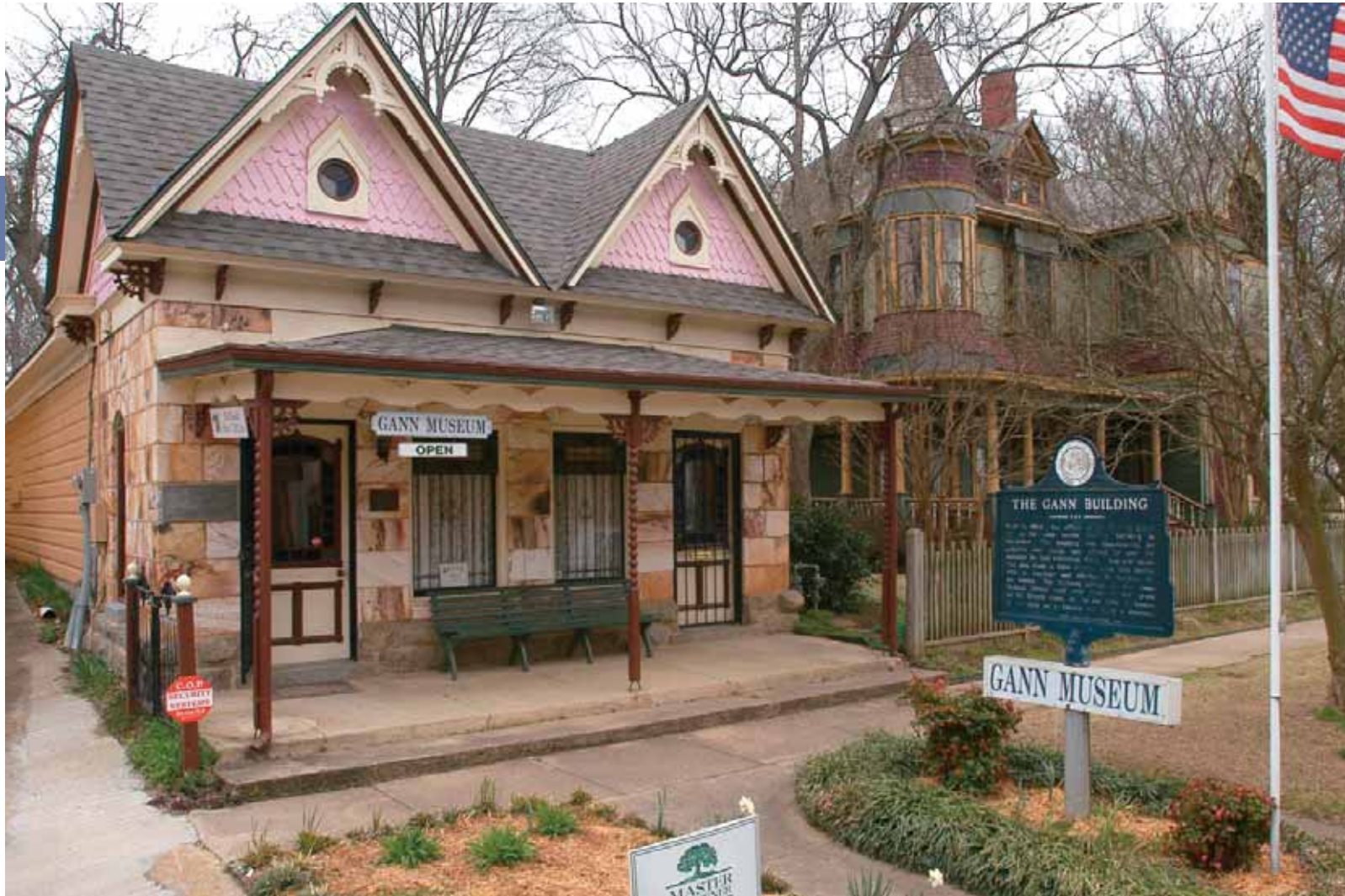
The Gann Museum of Saline County houses a wealth of Arkansas artifacts.

WHEN THE ARTS ARE INTEGRATED WITH BUSINESS AND SCIENCE, THEY CAN INFLUENCE SOLUTIONS, AND PRODUCTIVITY.