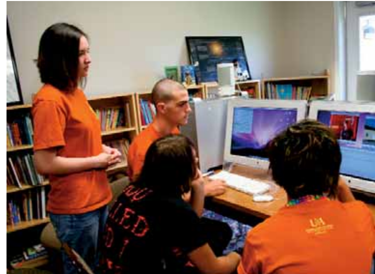
The Ozark Film Fest, through its T Tauri program, trains young people to become film makers.

Further, creative enterprises include a set of companies and institutions that have overlapping needs and interests, benefit from proximity to one another, and can be described and treated as a “business cluster”. In simple terms, the value chain in Arkansas’s creative economy includes: