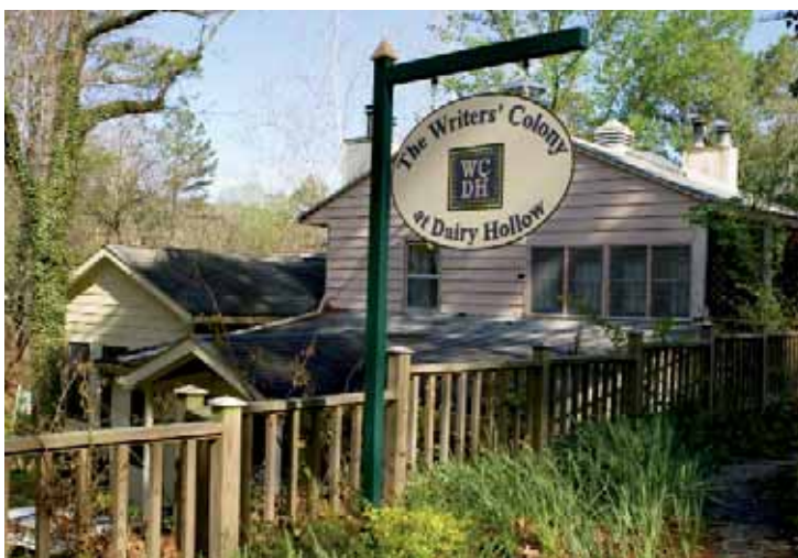
Eureka Springs' Famous Writer's Colony

There is considerable potential for greater synergy between arts councils, for example, and local economic development organizations. Whether it is putting on a festival or helping private companies find qualified graphic designers, better coordination will advance the missions of both types of organizations. A