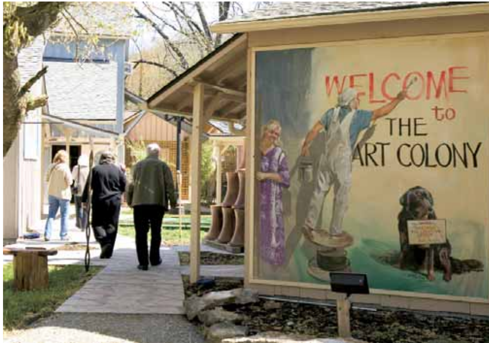
The Art Colony in Eureka Springs