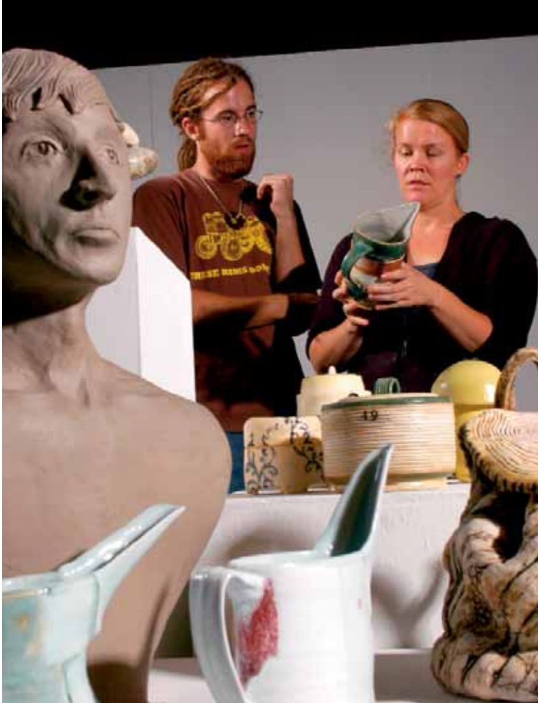
University of Central Arkansas

statewide initiative, coordinated through the CELC, would pave the way for local cooperation. The state of Colorado, for example, encourages frequent collaboration between the arts and economic development by actually locating the Colorado's Arts Council in the state's Office of Economic Development.