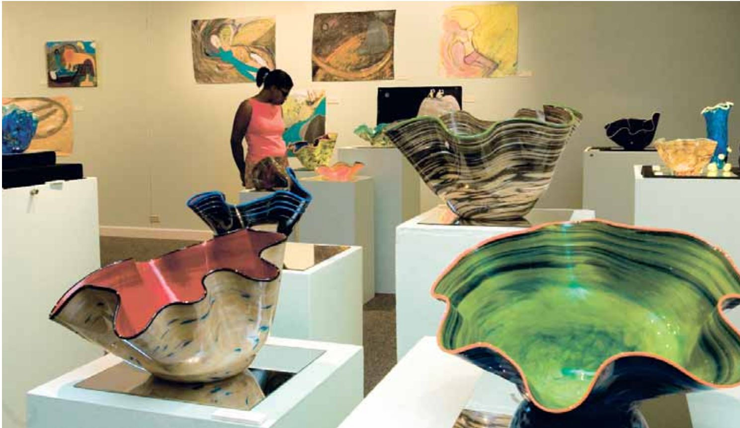
The Arts and Science Center of Southeast Arkansas in Pine Bluff

we recommend that the legislature become more explicit in addressing the state's creative economy. This would be best accomplished by encouraging champions within the Arkansas legislature to either form a creative economy subcommittee or add the responsibility for the creative economy to an existing committee.