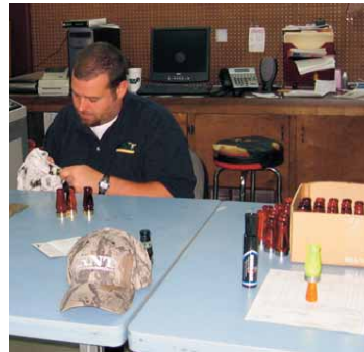
Duck call manufacturing in Stuttgart

NO LONGER CAN THE STATE BE SEEN AS JUST A PLACE THAT PRODUCES THINGS CHEAPER. IT NEEDS TO PUT ITS OWN STAMP ON ITS PRODUCTS INFUSED WITH THE CREATIVE ASSETS THAT ABOUND IN THE NATURAL STATE.